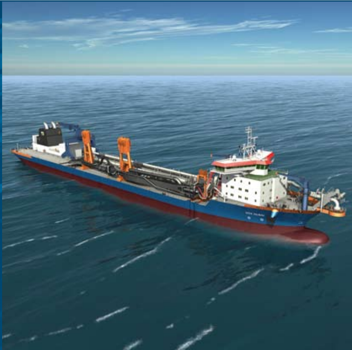
Trailing suction hopper dredger Vox Dubai